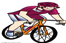
10 riding a bike