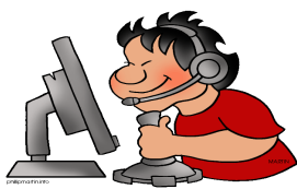
9 playing computer games