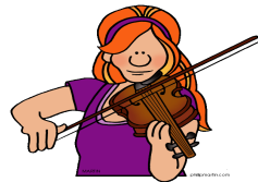
7 playing the violin