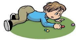
4 playing marbles