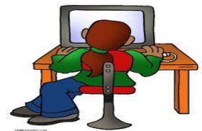
12 sending an e-mail